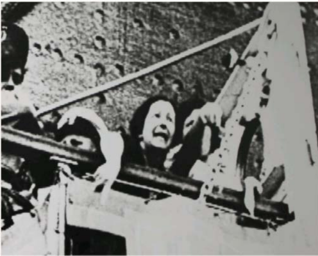
A woman cries as the St. Louis pulls away from Havana, 1939.

Source: "Map Showing the Voyage of the St. Louis, May 13-June 17, 1939.", American Jewish Joint Distribution Committee Archives, "The Story of the S.S. St. Louis (1939)"; http://archives.jdc.org/educators/topic-guides/the-story-of-the-ss-st.html (Last visited February 5, 2017).